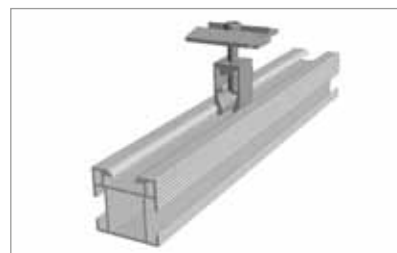
Module clamp with clickstone