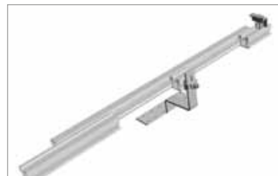
Telescoping end piece