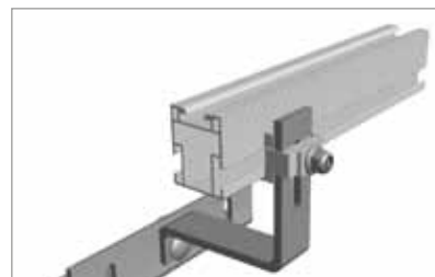
Roof hook with rail connection